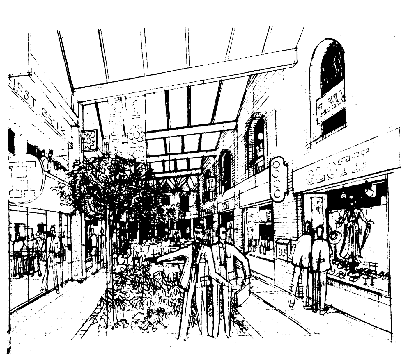
FROM INSIDE MALL—This is architect's conception of enclosed mall at rear of Park Street buildings. Mall would possibly be air-conditioned and heated.